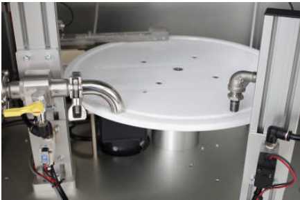
Original detection system